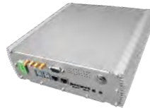
Alternate Housing Option