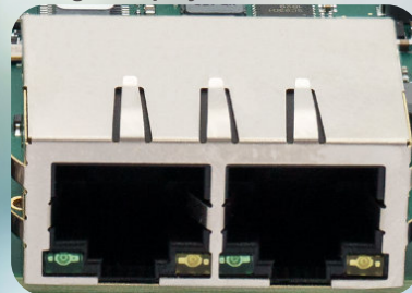
Dual Gigabit Ethernet