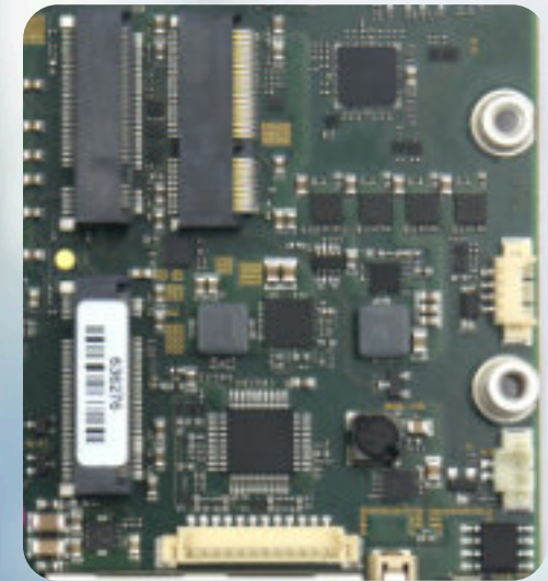
Triple M.2 Sockets / WLAN_BT / 4G_5G

The information contained in this document has been carefully checked and is believed to be reliable. However, E.E.P.D. GmbH makes no guarantee or warranty concerning the accuracy of said information and shall not be responsible for any loss or damage of what ever nature resulting from the use of, or reliance upon, it. E.E.P.D. does not guarantee that the use of any information contained herein will not infringe upon the patent, trademark, copyright or other rights of third parties, and no patent or other license is implied hereby. AMD and the AMD logo are trademarks of Advanced Micro Devices, Inc. Intel and the Intel logo are trademarks of Intel Corporation or its subsidiaries in the U.S. and/or other countries.