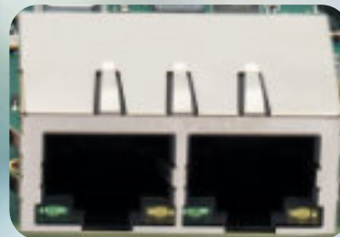
Dual 2.5 Gigabit Ethernet